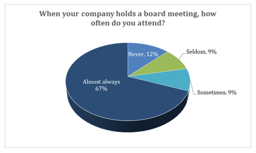
Figure 2 – General counsel attendance at board meetings

A board of directors that does not have a consistent relationship with the company's general counsel should be a cultural red flag and prompt further board inquiry. While the relationship between the general counsel and the board can take various forms, it is important that the relationship at least be consistent. After all, the board is the company's fiduciary representative, and the company is the general counsel's client (not members of the executive management team). A relationship between the general counsel and the board of directors enables the board to set the tone for the company's legal, ethical, and compliance culture, and also helps maintain the independence of the legal function.